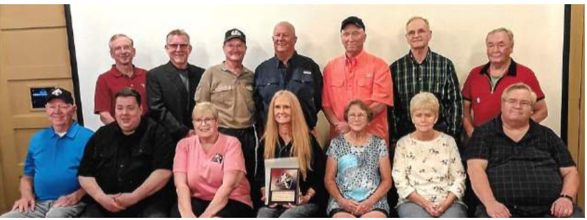
2022 Horseshoe tour Hall of Fame members