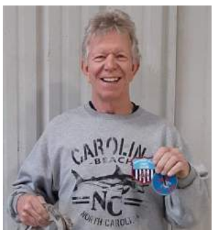
Merle South 60% game & High game