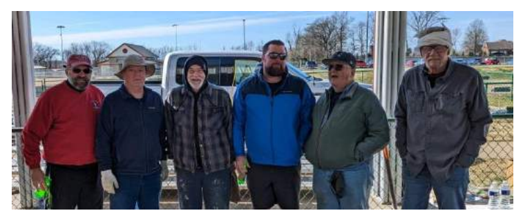
3-26-22 CCK everyonecold and windy day!!